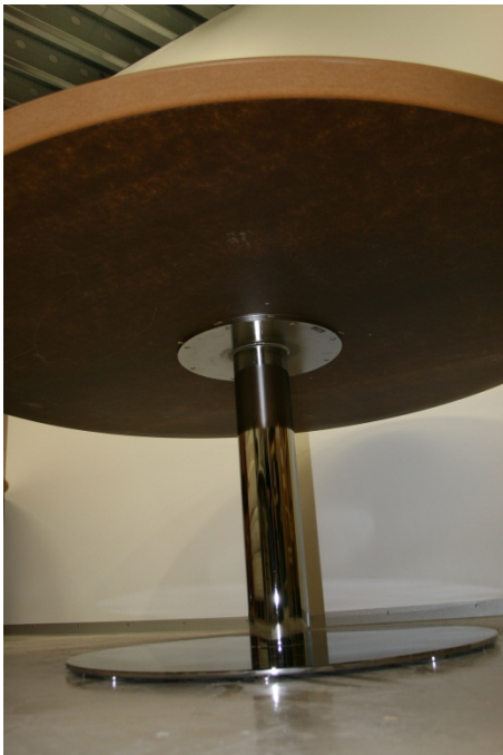
Picture 2 Plain table, joint between pillar and table top