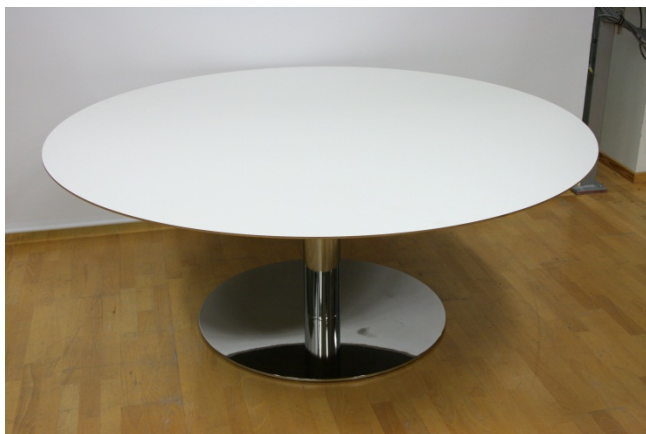
Figure 1 Plain table

Dimension: H=720 mm, Ø 1800 mm. Table top: In 25 mm laminated MDF Ø 1800 mm. Pillar: Ø 133 mm in steel. Foot: Ø 900 mm in 18 mm steel plate Functions: - Other info: -