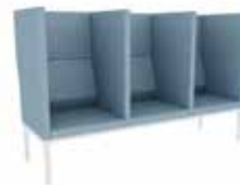
3-seater, middle high back, dividing walls

Seat height (cm) 42/46 Total height (cm) 125/129 Total width (cm) 200 Total depth (cm) 66