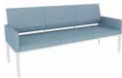
3-seater, low back height, open back, armrests

Seat height (cm) 42/46 Total height (cm) 84/88 Total width (cm) 190 Total depth (cm) 66