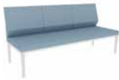
3-seater, low back height

Seat height (cm) 42/46 Total height (cm) 84/88 Total width (cm) 180 Total depth (cm) 66