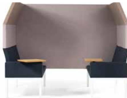
2-seater, high back, dividing wall 212cm, armrest with clipboards