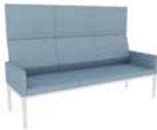
3-seater, middle high back, armrest

Seat height (cm) 42/46 Total height (cm) 124/128 Total width (cm) 190 Total depth (cm) 66