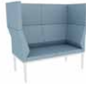
2-seater, middle high back, long coner back

Seat height (cm) 42/46 Total height (cm) 124/128 Total width (cm) 132 Total depth (cm) 66