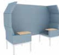
2-seater, high back, dividing wall 212cm, armrest with clipboards

Seat height (cm) 42/46 Total height (cm) 162/166 Total width (cm) 212 Total depth (cm) 85