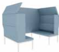
4-seater, high back, dividing wall 212cm, 1/2 dividing wall

Seat height (cm) 42/46 Total height (cm) 162/166 Total width (cm) 212 Total depth (cm) 130