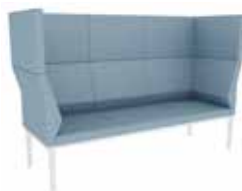
3-seater, middle high back, long corner back

Seat height (cm) 42/46 Total height (cm) 124/128 Total width (cm) 192 Total depth (cm) 66