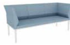
3-seater, low back height, long corner back

Seat height (cm) 42/46 Total height (cm) 84/88 Total width (cm) 192 Total depth (cm) 66