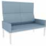
2-seater, middle high back, armrest

Seat height (cm) 42/46 Total height (cm) 124/128 Total width (cm) 130 Total depth (cm) 66