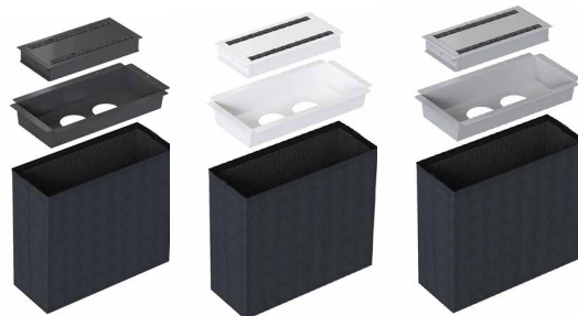
Powerdot package 31x15cm Cover and tray in black, white or silver

Powerdot package, 2 Powerdot Electric (2 power)