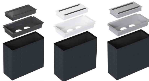
Powerdot package 31x15cm Cover and tray in black, white or silver

Powerdot package, 2 Powerdot Electric (2 power)