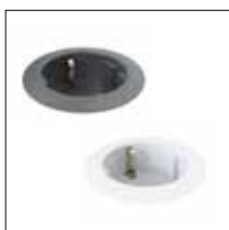
Powerdot Mini Electric 1 power (type F, Schuko) Black / white