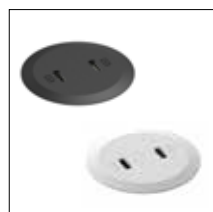
Powerdot Mini USB 2 USB-C PD (30W/20V/1,5A) Black / white