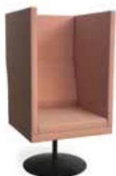
Reform 1-seater, Stay base