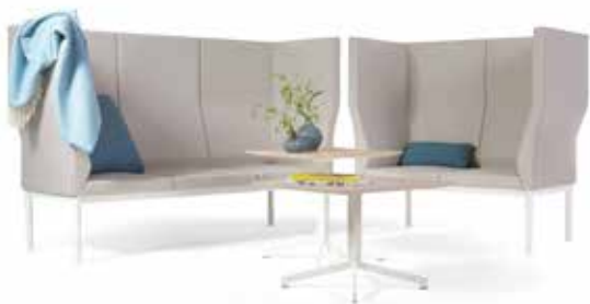
Reform middle high back, long corner back