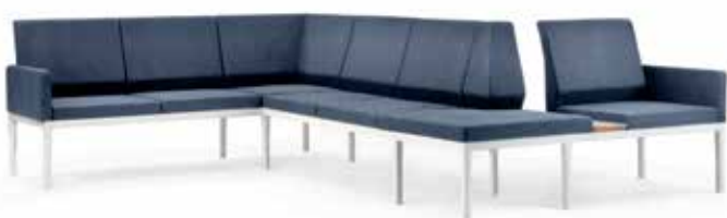
Reform low back height

Reform sofa system offers endless combination possibilities. There are different back heights, seat heights, 42, 46 and 65cm, different armrest/dividing walls and a variety of modules. Reform with open back comes with removable covers.