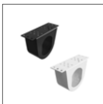
Powerdot bracket mini, single Black / white