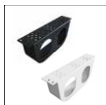
Powerdot bracket mini, double Black / white