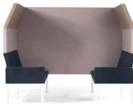
2-seater, high back, dividing wall 212cm, armrest