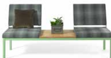
Reform, low back height, open back, oak table