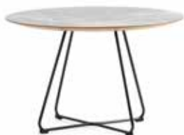
Speed Table 47