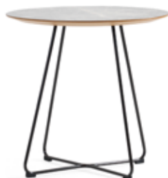
Speed Table 57