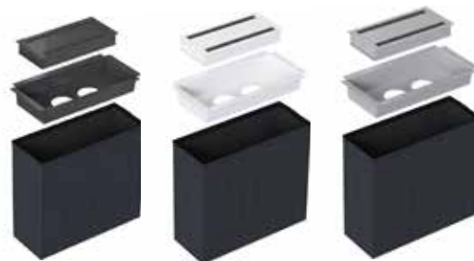
Powerdot package 31x15cm Cover and tray in black, white or silver

Powerdot package, 2 Powerdot Electric (2 power)