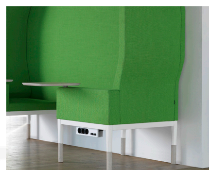
Reform with Power hub