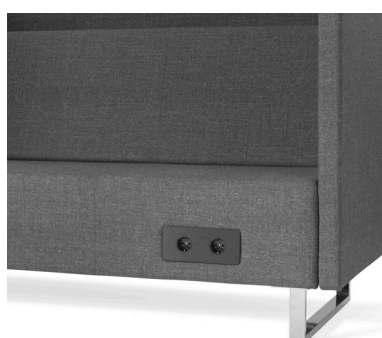
U-sit with Power point