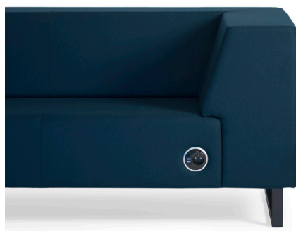
U-sit with Pixel